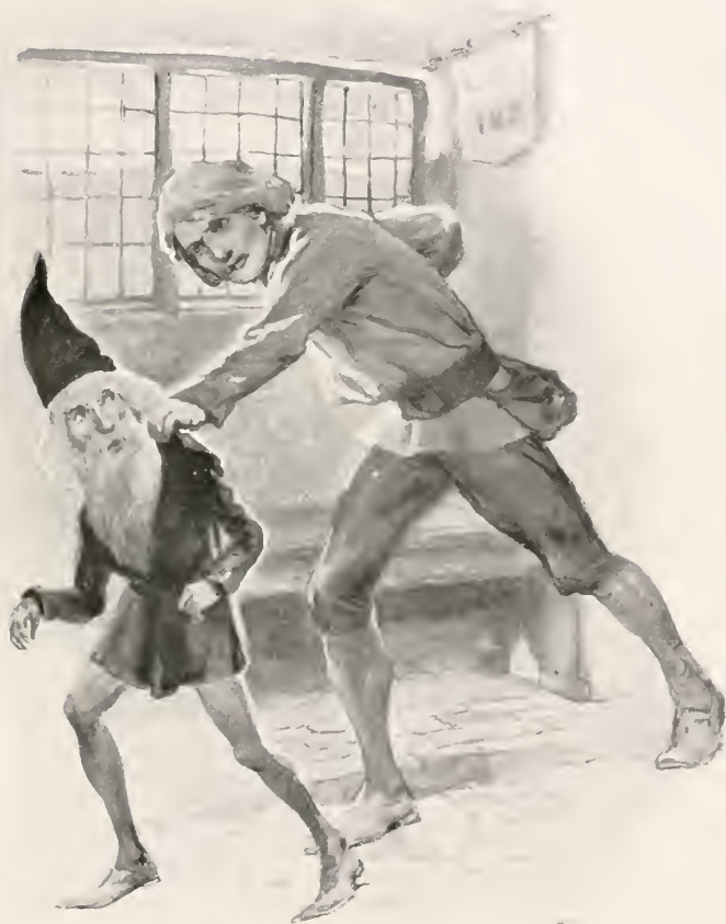
Peter grabbed the Glass-man by the collar. (p. 241.)

Glass-man by the collar and cried—"Now I have you, Master Glass-man, and I will not let you go until you have granted me a third wish. Give me now at this very moment, on this very spot, two